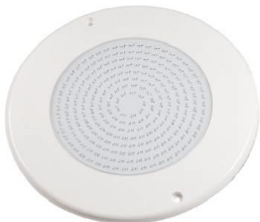
35 / 18 W