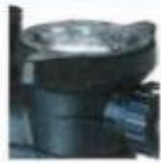
Easy access to the pre-filter through the quarter turn cover