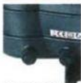
Drainage caps for convenient servicing