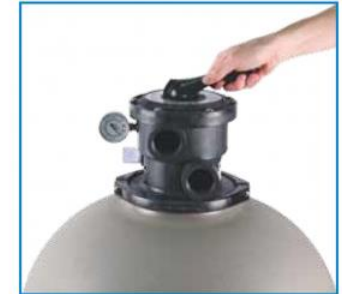
Vari-Flo™ 7-Position Control Valve with easy-to-use lever-action handle lets you "dial" any of seven valve/filter functions.