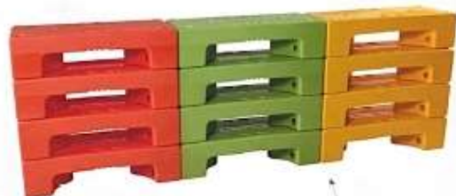
Puzzle Step in box di stoccaggio Puzzle Step storage